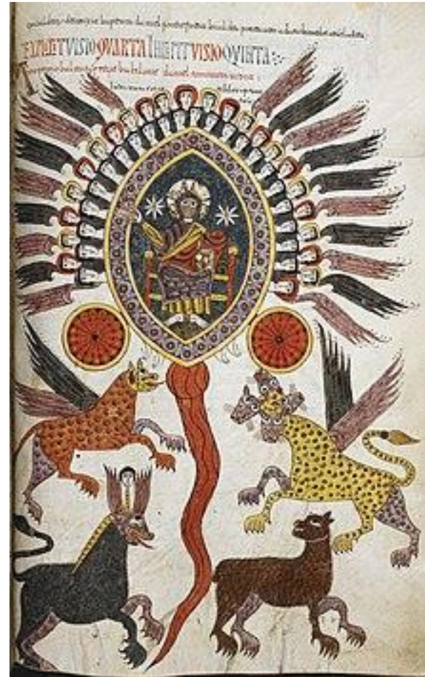
from the Silos Apocalypse, 12 c.

Dan 7:13-14: 13 As I watched in the night visions, I saw one like a human being (LXX: ὡς υἱὸς ἀνθρώπου) coming with the clouds of heaven. And he came to the Ancient One and was presented before him. 14 To him was given dominion and glory and kingship, (LXX: “authority”) that all peoples, nations, and languages should serve him. His dominion is an everlasting dominion that shall not pass away, and his kingship is one that shall never be destroyed.