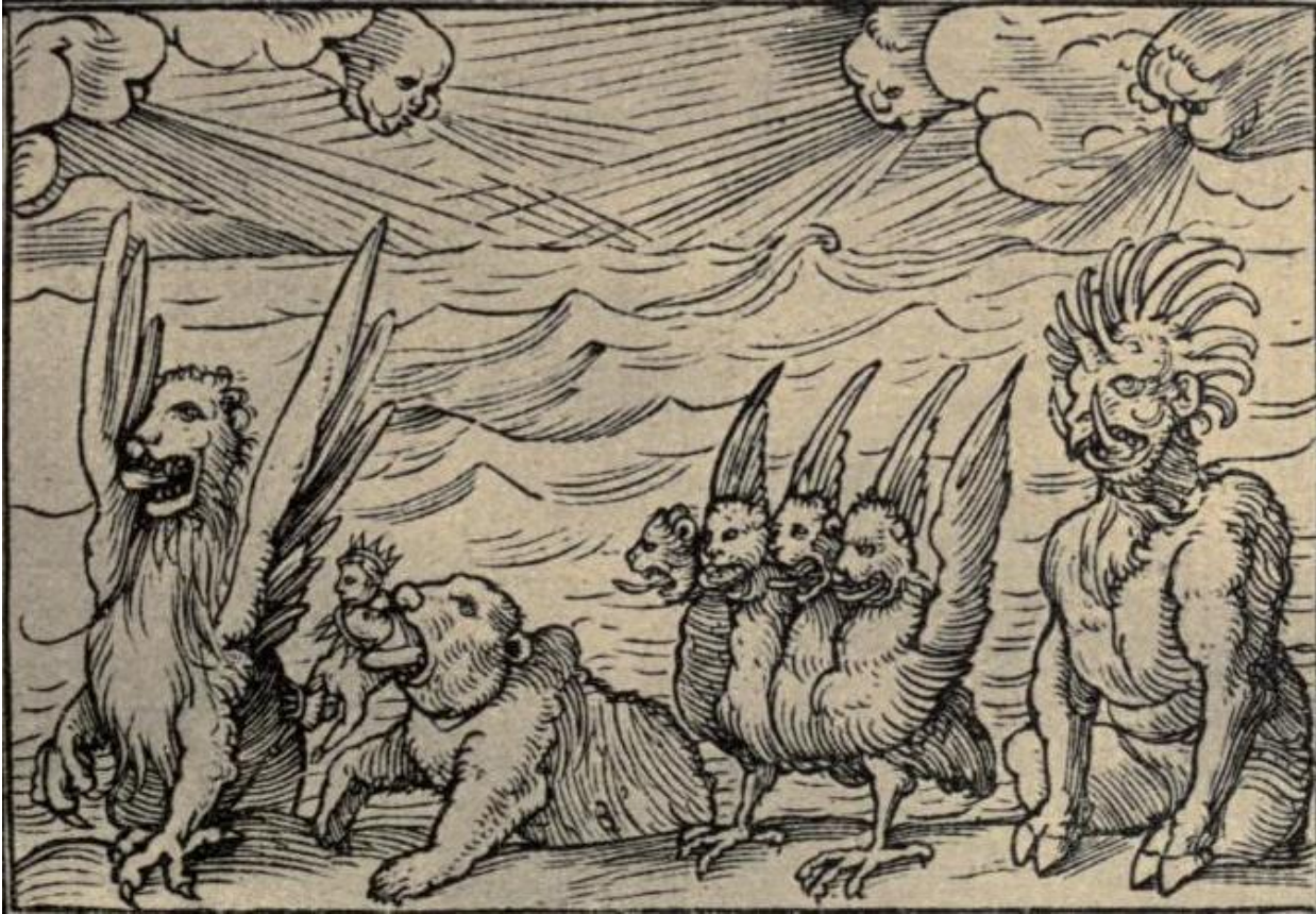
Daniel's vision of the four beasts – woodcut by Hans Holbein the Younger

Dan 7:9: As I watched, thrones were set in place, and an Ancient One took his throne, his clothing was white as snow, and the hair of his head like pure wool; his throne was fiery flames, and its wheels were burning fire.