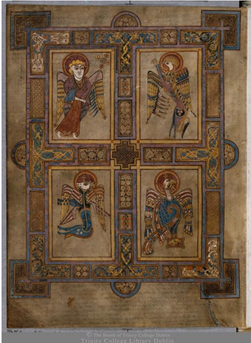
The four Evangelists from the Book of Kells